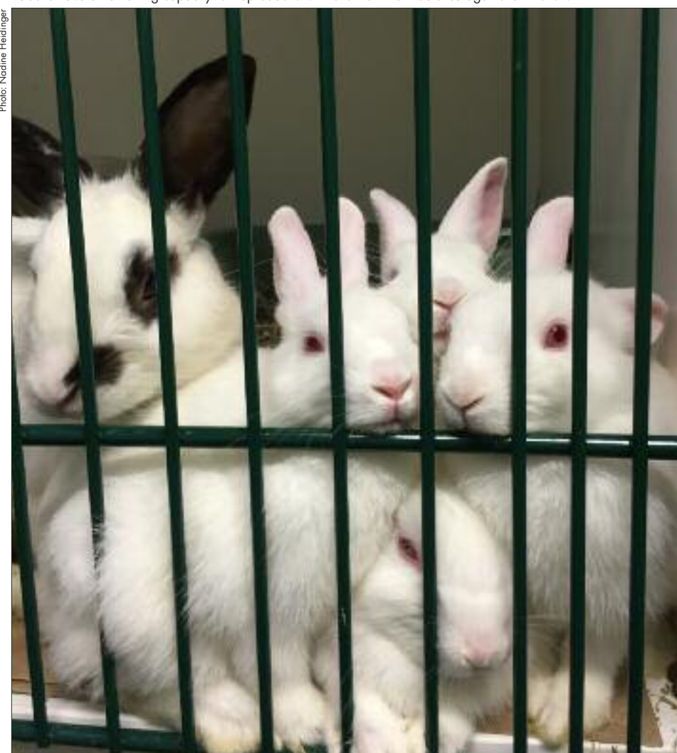
Salt&Pepper (mom) and her babies Chevron, Stitch, Chequer and Batik.