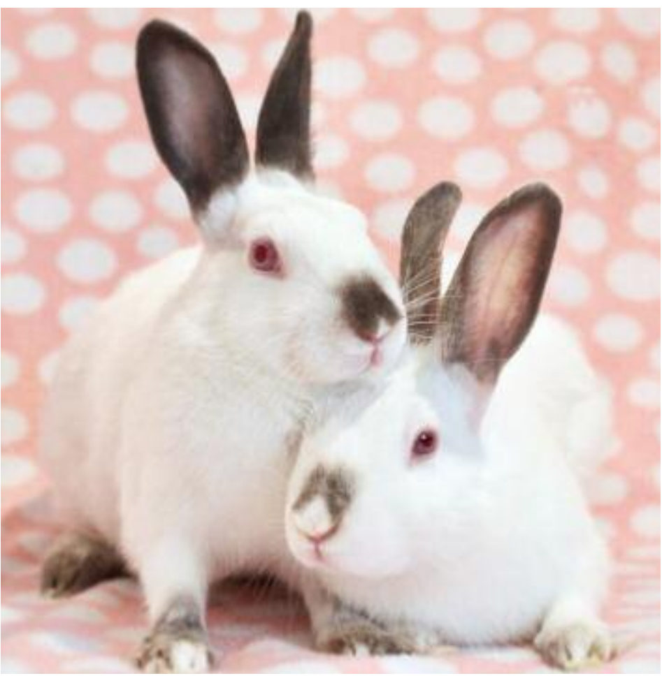
Purple and Blue.

Carmela is a young medium-sized Rex rabbit. Her beautiful coat is mostly white with tan and black spots. She is a sweet rabbit who loves to have her soft