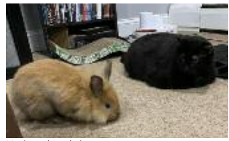
Mochi and Jezebel.