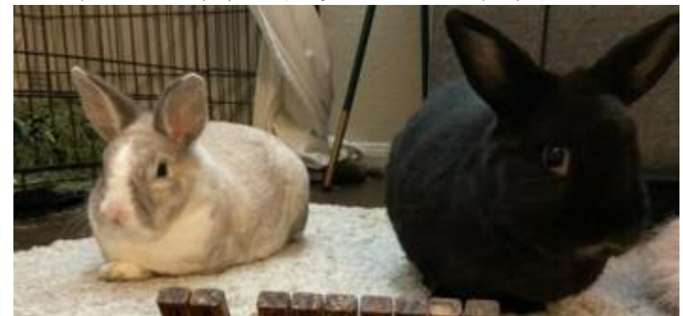
Marshmallow and Ebony.