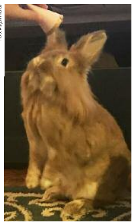
Nala is not a fan of party hats and thinks her mane is a more than good enough accessory!

More than one person has let me know they have seen pet bunnies out and about with their humans, whether it be on a harness on a walk, or even at an outdoor dining location. In fact, a few