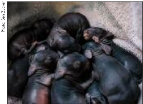
River and Dale (see Thump, February 2017) are the parents of these eight kits. The parents and kits have all found forever homes.

2,563,853,248 x 3 x 12 = 92,298,716,930 female babies (92,298,716,930 + last year's 2,563,852,248 = 94,862,569,180!)