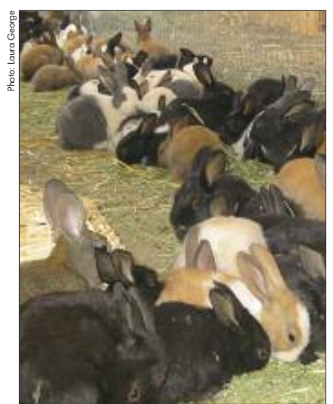
Best Friends' "Great Bunny Rescue" of 2006.

You can see why people use the phrase "reproducing like rabbits." This amazing capacity for reproduction is the main defense Oryctolagus cuniculus has against extinction, since they have so many predators in the wild.