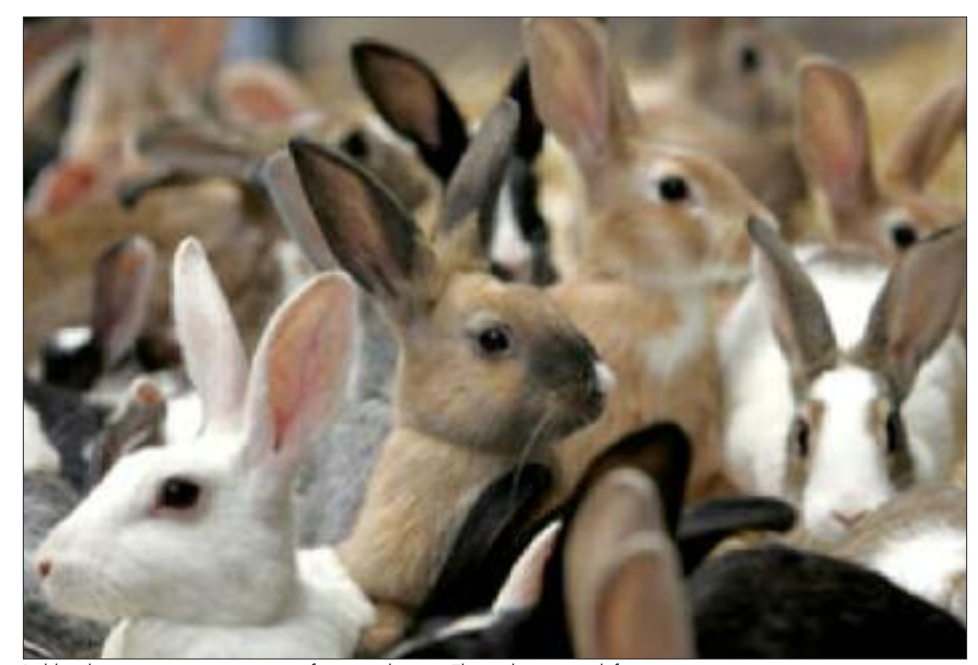
Rabbits have an amazing capacity for reproduction. This is their main defense against extinction.

Do the bunnies of the world a favor: have your companion rabbit spayed or neutered.