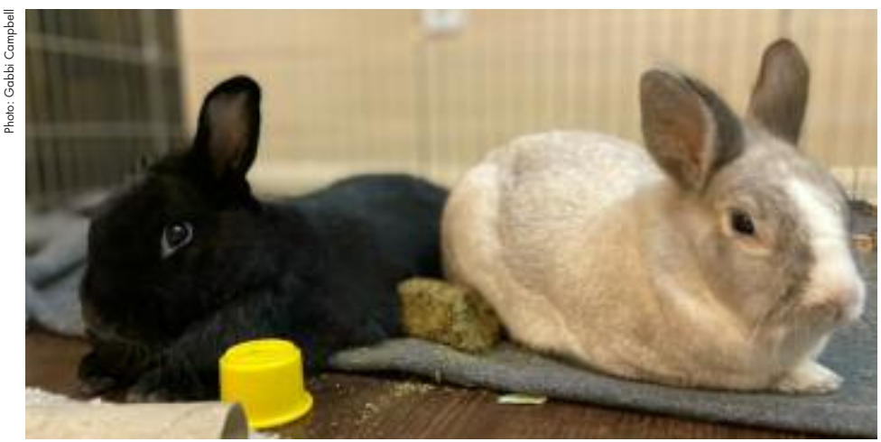
Gabbi Campbell's bunnies: Ebony, 7 years old (a Long Island Rabbit Rescue Group adoptee) with Marshmallow, 8.