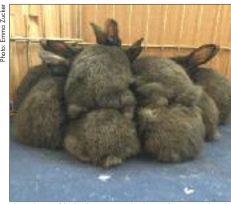
The pileup of baby bunnies is the litter of River and Dale at around five or six weeks.

That's nearly 95 billion female rabbits in seven years!