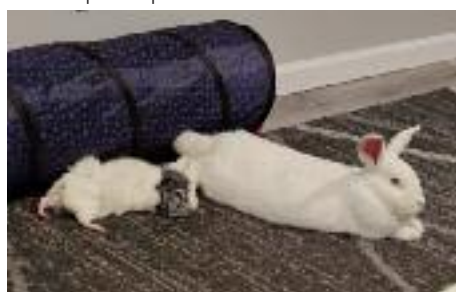
Guinea pig Spunkies with Pat.