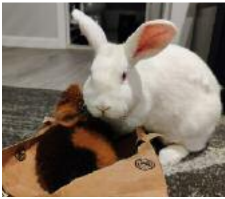
Pat with guinea pig Chomps.