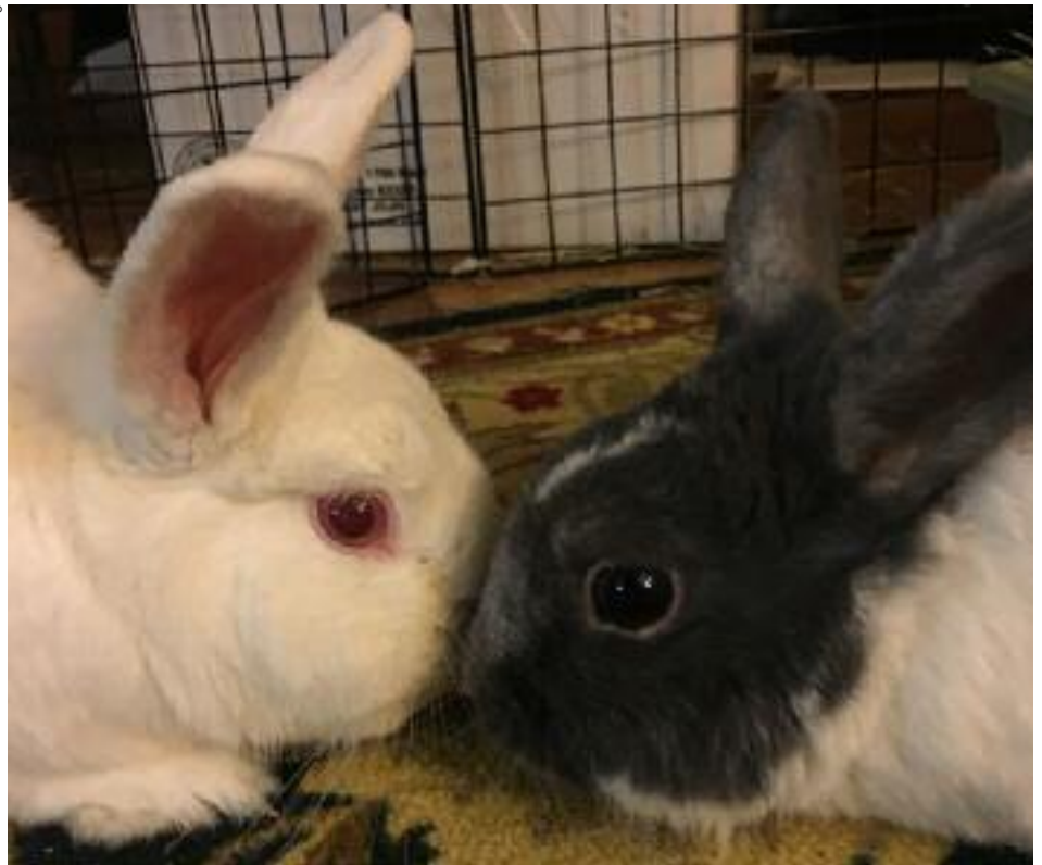
Milo and Victoria.