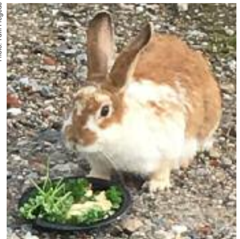
Bun number 2 (female) spotted in morning after bun number 1 was rescued.