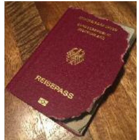
Butter's demolition project.