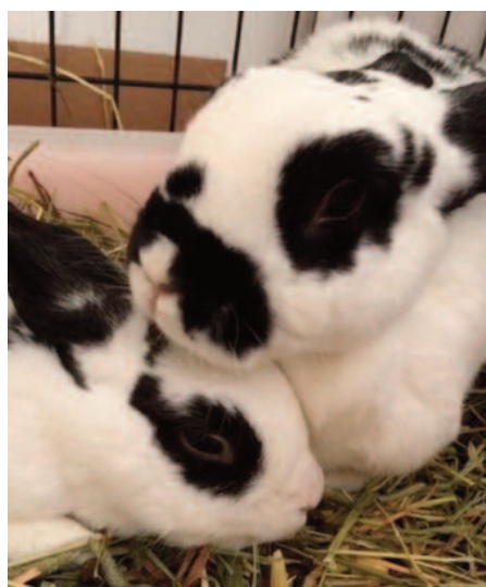
Cow grooms her daughter Suji.

There is a pet store on 72nd Street that let me put a poster in the entryway. I