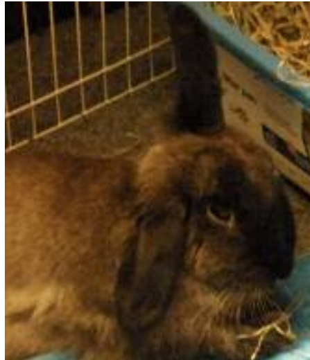
Cameron with right ear lopped down.

there was a lot of human interaction. Cameron may not have been the most social rabbit, but he never said no to a head rub.