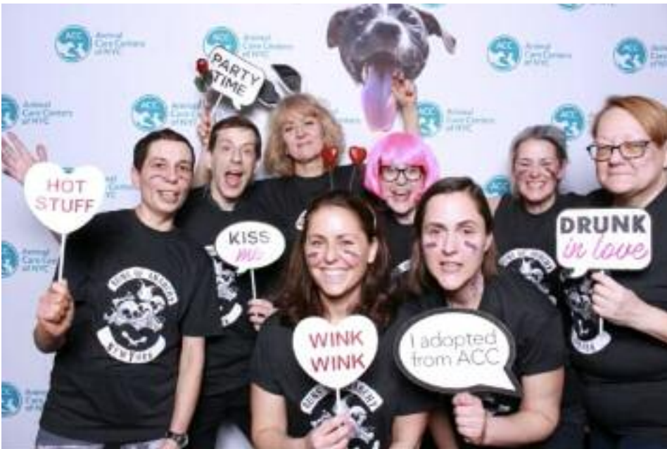
ACC volunteers formed a 'Buns of Anarchy' bowling team to compete in a Feb. 13 fundraising event at Lucky Strike on West 42nd Street, for Animal Care Centers of NYC.