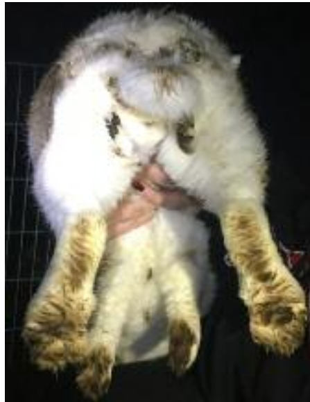
Bun number 1 shortly after rescue.