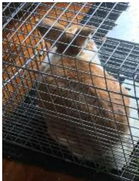
Bun number 2 was trapped in this humane cage.

the catch. She and the fosterer arrived and they took home bun No. 1.