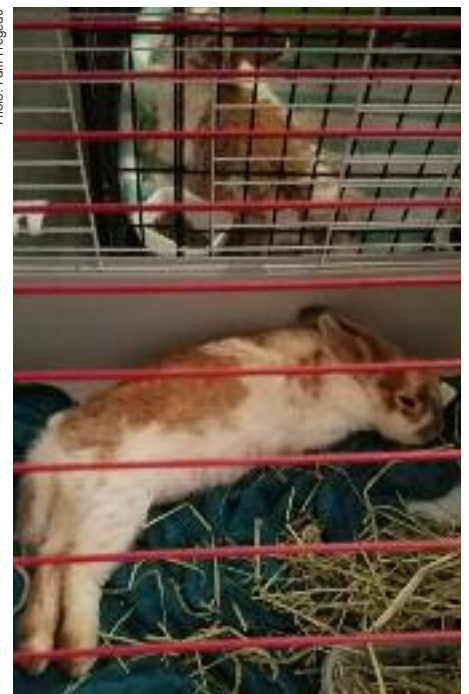
Buns number 1 and 2 settled in foster home.