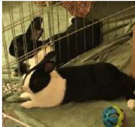
Vinny and Paulie separated.

and the puppy pen had been somehow reconfigured. Still unaware I was there, the two of them were on either side of a stack of newspapers, trying to bring it down.