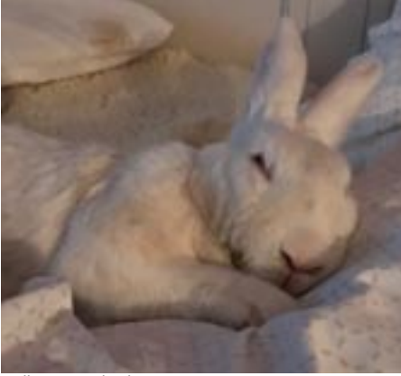
Colleen sound asleep.