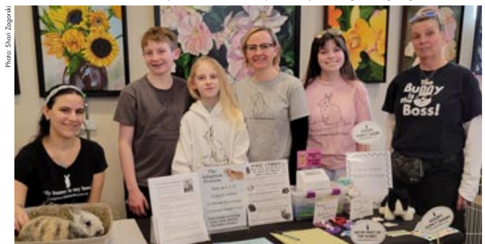
A group photo at Oceanside Library.