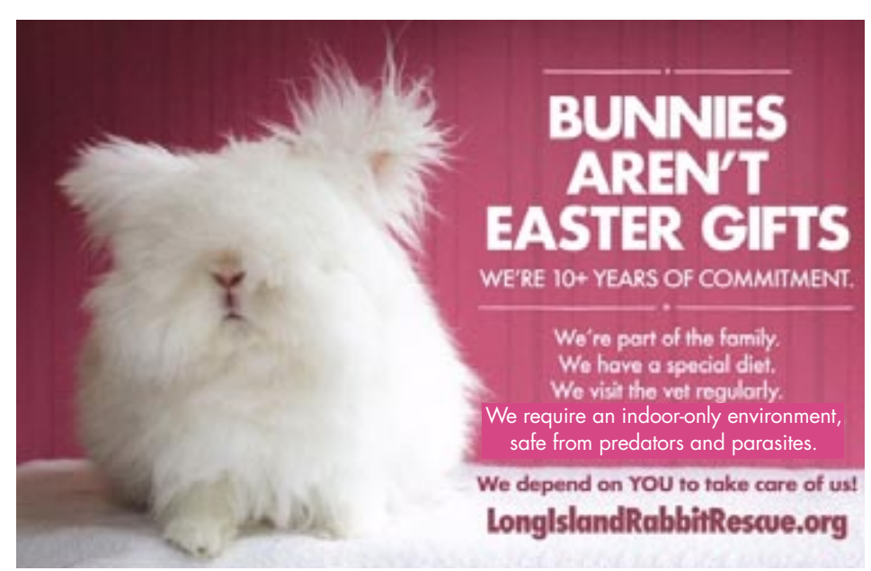
Easter posters are available to download and share on our website, rabbitrescueandrehab.org. Help us spread the message that rabbits are not toys for Easter.

Recently, someone contacted us to immediately pick up a rabbit because he