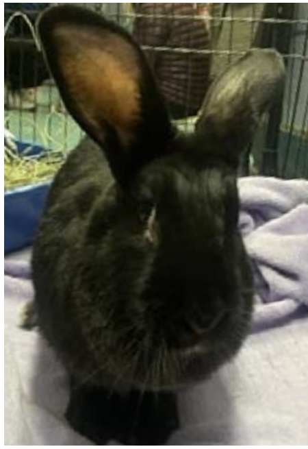
(Continued on page 16)