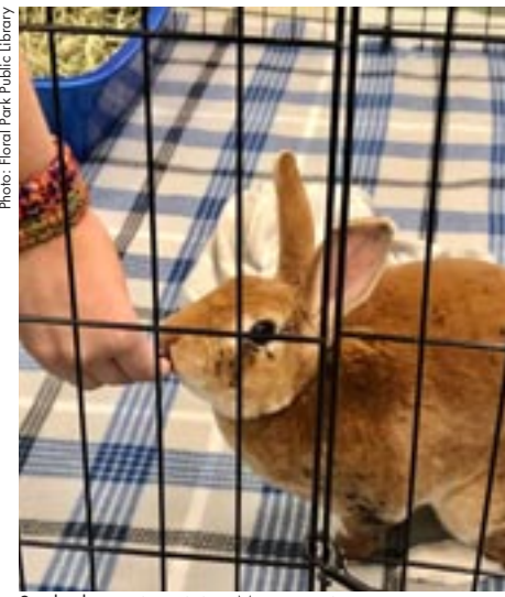
Spokesbunny-in-training Monte getting a treat.