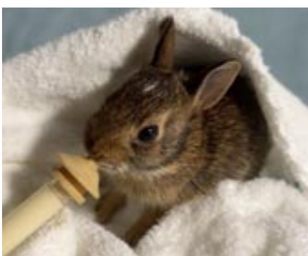
Tater Tot was attacked by a cat before being brought in to Cottontail Cottage Wildlife Rehab for care last spring. Tater was later released back home to the wild with a few friends he had made while he was being cared for.

• Are there crows, cats or dogs stalking them? Measures can be taken to protect a nest from dogs, such as placing a laundry basket over the nest and keeping dogs on a leash temporarily until the rabbits have left in a few weeks. Unfortunately, when cats or crows find the nest or babies, they almost always need to be taken to a