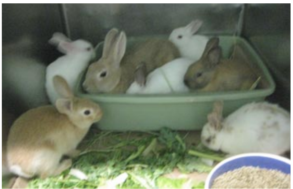
Caramel and her babies at Manhattan Animal Care Center (NYC ACC)

What are some other reasons to get your rabbit spayed or neutered? Fixed rabbits are much easier to litter train and are generally tidier than unfixed rabbits.