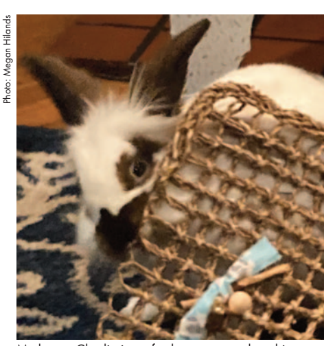
My bunny Charlie is perfectly content to chew his vetapproved seagrass mat indoors.

When I meet new people and they learn I have bunnies, often one of the first questions they will ask is, "How much time do your bunnies spend outside?" Many express surprise when I reply with "none at all." I then typically offer a quick explanation of the dangers that lie outside the front door, including fly strike and predators, and they start to understand why I elect to keep my bunnies indoors.