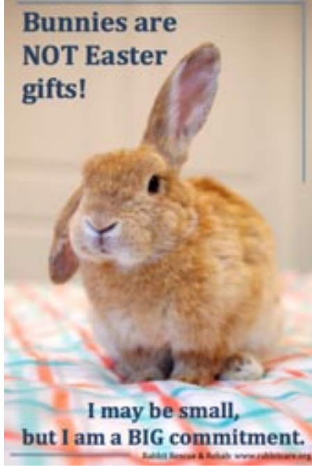
Easter posters are available to download and share on our website, rabbitrescueandrehab.org. Help us spread the message that rabbits are not toys for Easter.