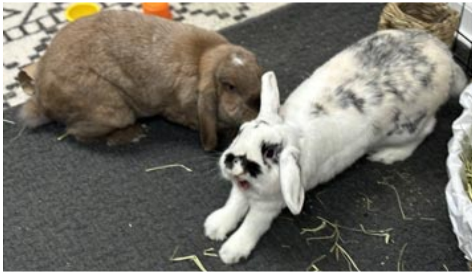
Diamond and Reggie.

Reggie is the kind of rabbit who makes his presence known! He is playful and