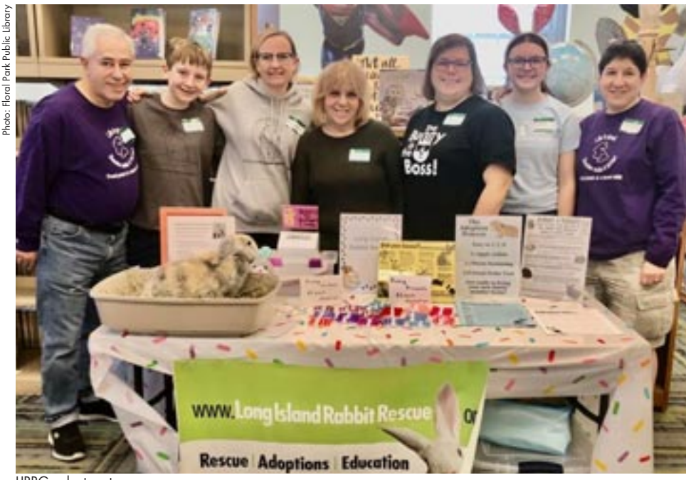
LIRRG volunteer team.