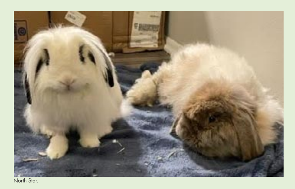
North Star, a feisty bunny who had been at Manhattan ACC, found her forever home in New Jersey and now has a husbun.