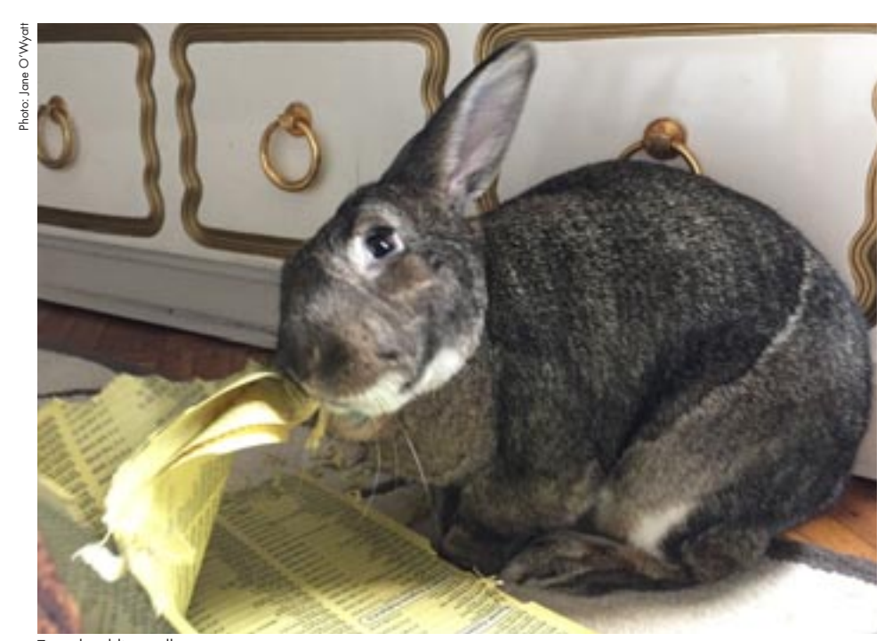
Tina shredding yellow pages.