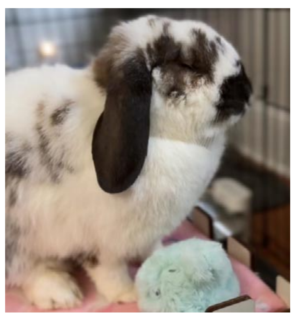
This is Cookie. She was abandoned outside and only has one eye. She is safe with us now.

Over the years, we have rescued many hundreds of rabbits outdoors, which is